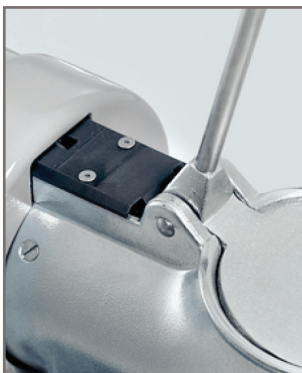
Magnetic Microswitch On The Lever