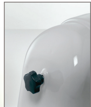
Cut Thickness Adjusting Knob