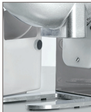
Collecting Tray With Microswitch